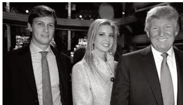
Trump with daughter Ivanka and son-in-law Jared Kushner.

Jared Kushner (Ashkenazi Jew)- Chief Executive Officer, Kushner Companies; Publisher, Observer Media. The New York Times has called Trump's son-in-law "the quiet fixer of the campaign."