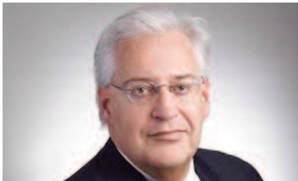
David Friedman, Trump adviser.

David Friedman (Ashkenazi Jew)- Partner, Kasowitz, Benson, Torres & Friedman LLP, an adviser to Donald Trump and columnist for Israel National News and president of the American Friends of Bet El Communities in Israel.