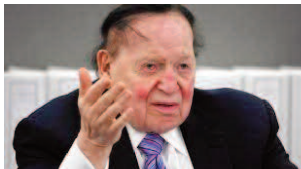
Sheldon Adelson, Las Vegas Billionaire Casino Magnate.

Sheldon Adelson (Ashkenazi Jew)- Chairman and Chief Executive Officer, Las Vegas Sands Corporation,. The Associated Press wrote 'Billionaire casino executive Sheldon Adelson is already at work on behalf of presumptive Republican presidential nominee Donald Trump. "I'm asking for your support" for Trump, Adelson wrote in an email Monday to more than 50 Republican Jewish leaders. Adelson told them he had met with Trump recently and is "specifically convinced he will be a tremendous president when it comes to the safety and security of Israel."